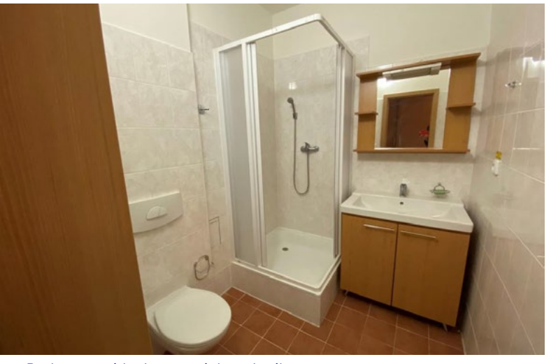
Bathroom with shower, sink and toilet