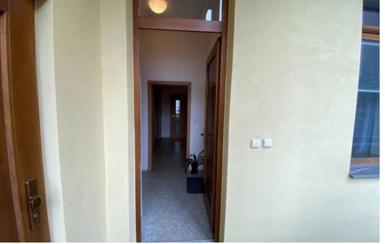
Entrance with the hall as seen from outside the flat