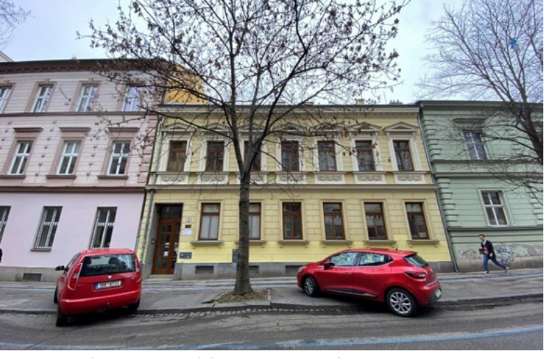
Building (the yellow one) from the outside, from Grohova Street