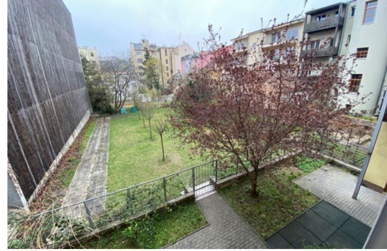
The private courtyard with garden adjacent to the building