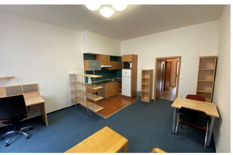
Combined living room and dining room with kitchenette