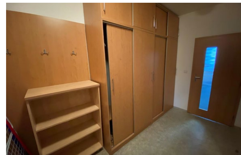
The hall with wardrobes and entrance door